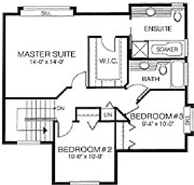
SECOND FLOOR PLAN 819 SQ. FT. (76.1 M 2 )