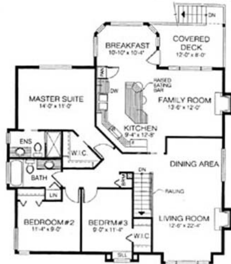
MAIN FLOOR PLAN 1422 SQ. FT. (132.1 M 2 )

WIDTH - 38'-0" (11.6M) DEPTH - 50'-0" (15.2M)